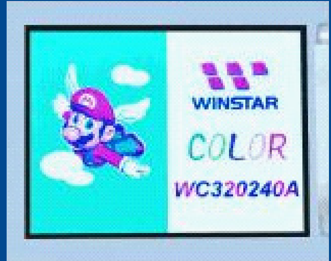
Color graphic display

Beside display products Dracon-Eltron offers 8 technology groups with product lines and services which make production and your product more reliable and more efficient. We offer you within these core areas an optimum of service.