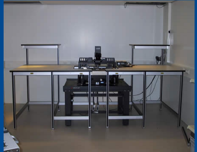
Measure work Elegance in the electronic industry

Beside soldering and cleaning solutions Dracon-Eltron offers 8 technology groups with product lines and services which make production and your product more reliable and more efficient. We offer you within these core areas an optimum of service.