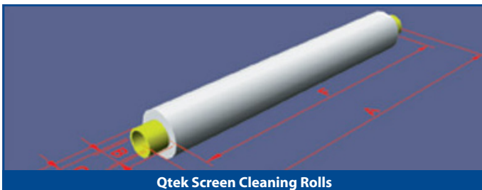
Qtek Screen Cleaning Rolls