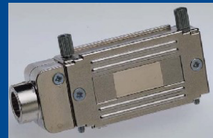
Modular hood system