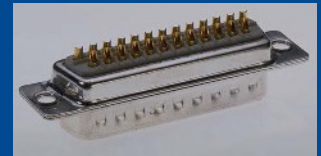
Wire solder connector