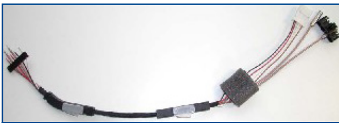
Cable assembly with moulding