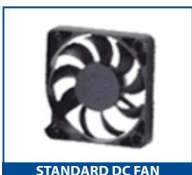
STANDARD DC FAN