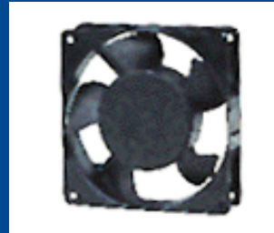
STANDARD AC FAN